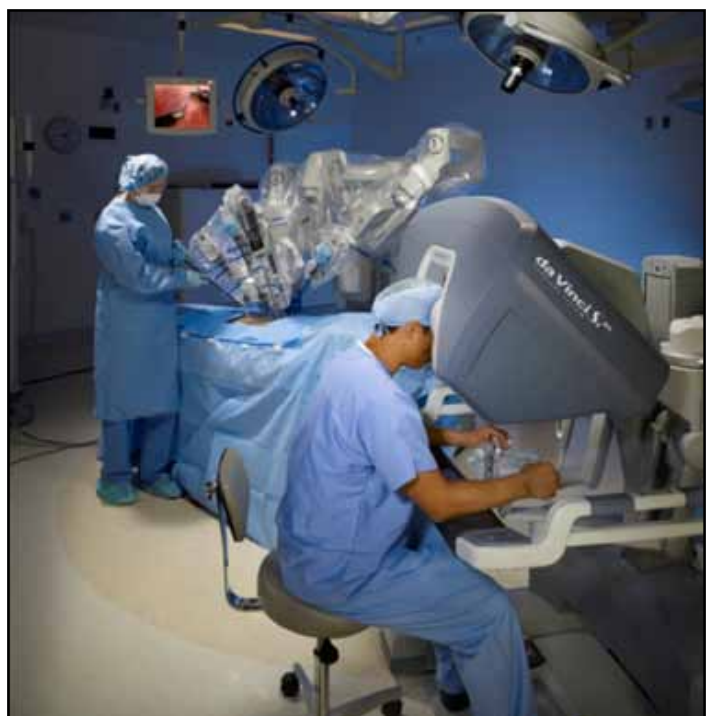
Figure 1. The da Vinci Robotic System